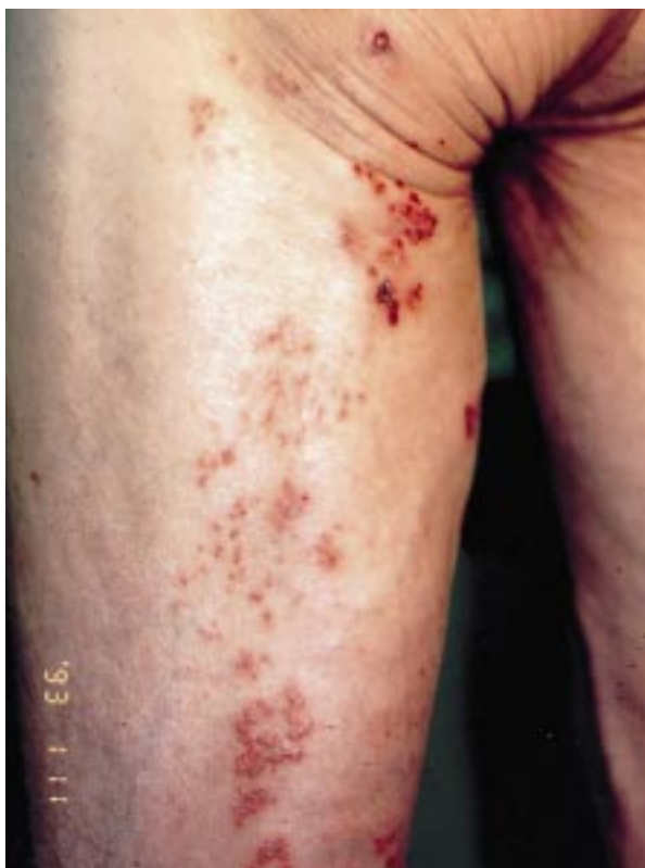
Fig 4. Herpes zoster in distribution of sacral nerves 1 and 2.

10% to 15% of all patients with zoster 53 and at least 50% of patients older than 60 years of age. Usually, patients experience a significant reduction of pain within 6 months, although this is variable. 54 Other abnormal sensations can persist after healing of skin lesions and include pruritus, paresthesia, dysesthesia, or anesthesia.