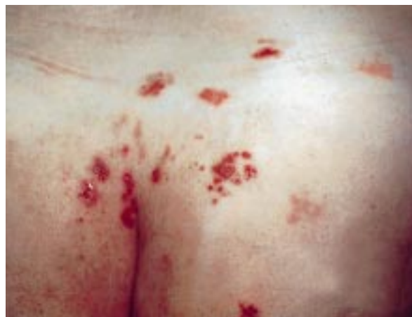
Fig 10. Zosteriform herpes simplex virus type 2.

obtained because VZV is a labile virus that is cultured much less readily than HSV. 69-71 Although limited by cross-reactivity with HSV, serologic tests such as complement fixation can be used to retrospectively diagnose VZV infection. 72 Currently, the most useful test to diagnose VZV infection is direct immunofluorescence of cellular material from skin lesions. However, molecular techniques with high sensitivity such as dot-blot hybridization and polymerase chain reaction have been used recently to detect VZV in the skin lesions, peripheral blood mononuclear cells, and other tissues of patients with VZV infection, and may be the diagnostic tests of choice in the future. 70,73,74