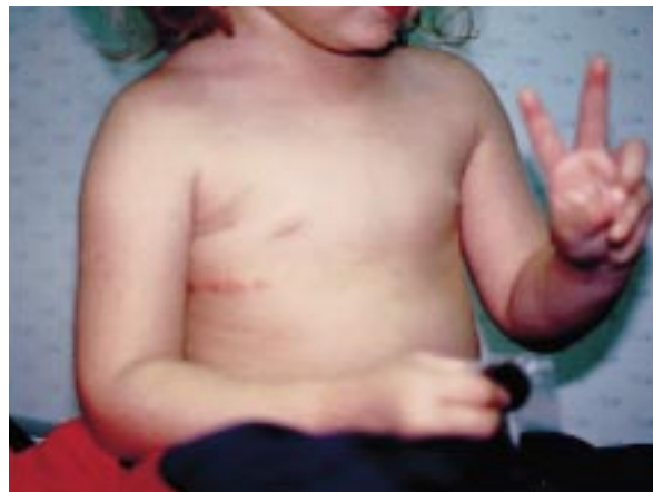
Fig 5. Herpes zoster in a 2-year-old girl.