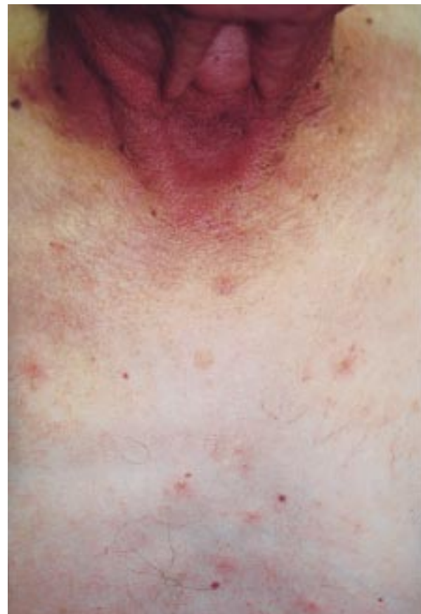
Fig 8. Disseminated vesicles of herpes zoster in patient seen in Fig 7.

The initial test of choice is usually a Tzanck smear performed by scraping the base of an early lesion and then staining with hematoxylin-and-eosin, Giemsa, Wright's, toluidine blue, or Papanicolaou. With herpes simplex or herpes zoster infections, multinucleated giant cells and epithelial cells containing acidophilic intranuclear inclusions can be seen. However, VZV cannot be differentiated from HSV infection using a Tzanck smear.