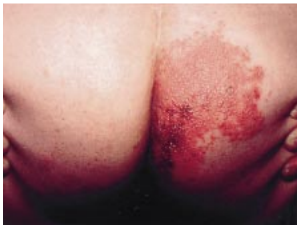
Fig 9. Perianal herpes zoster in an HIV-seropositive man.