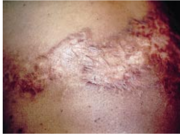
Fig 2. Hypertrophic scar from herpes zoster in an HIV-seropositive man.

and myelitis (eg, Guillain-Barre syndrome). 47 In adult varicella (Fig 1), varicella pneumonia is a frequent complication, occurring in 1/400 cases. 48 The mortality rate of adult varicella pneumonia is high, with death occurring in 10% of immunocompetent and 30% of immunocompromised patients. 49 Rarely, myocarditis, glomerulonephritis, appendicitis, pancreatitis, hepatitis, Henoch-Schönlein vasculitis, orchitis, arthritis, optic neuritis, keratitis, or iritis can result. 45