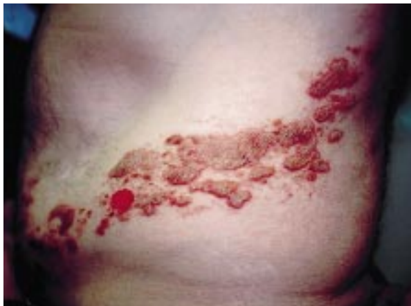
Fig 3. Herpes zoster in the L-1 dermatome.